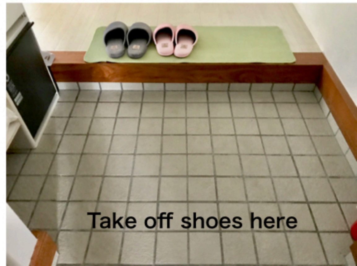
Take off shoes here