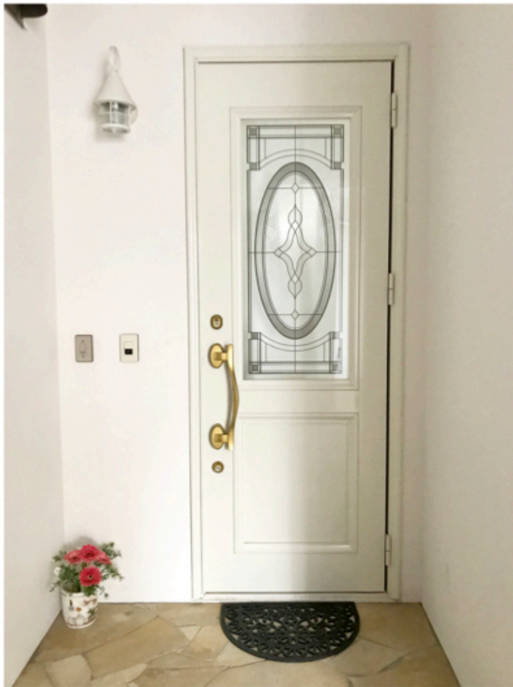
The Entrance Door