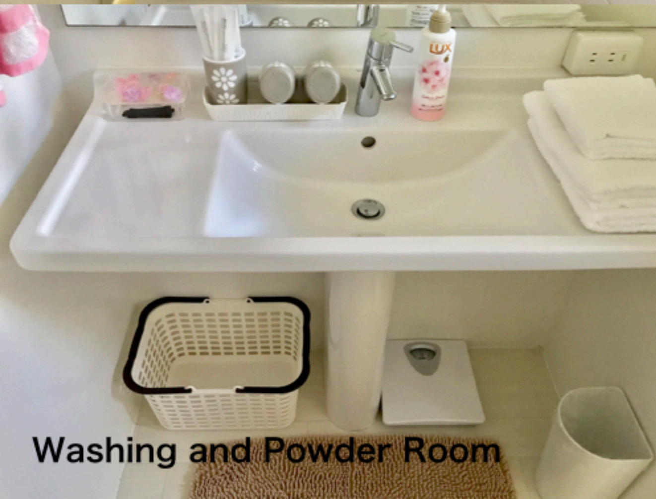
Washing and Powder Room